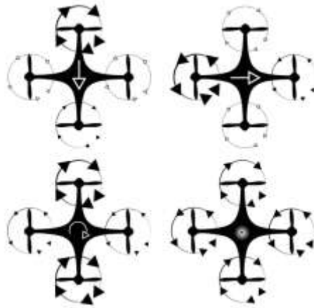
Figure 2. Quadcopter maneuvers (a) pitch, (b) roll, (c) yaw and (d) thrust

Multicopters are sold with the options of do-it-yourself and ready to fly. Possibility of doing modifications on “Ready to fly” kits is possible. It is indicated that multicopter models which can be supplied easily and cheapish can reach at 72 km/h (45mil/h) speed, carry useful cargo about 400gr (14.11 ons) and they have also 25 minutes endurance[4].